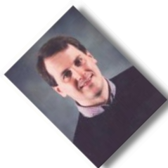
Figure 2—Image of the author scaled by 0.5 and rotated by 45°.